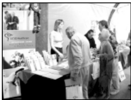
Dieticians provided information on heart-healthy nutrition.

• Promotional materials: Screening opportunity and informational flyers were mailed to 23,000 UCSD affiliate