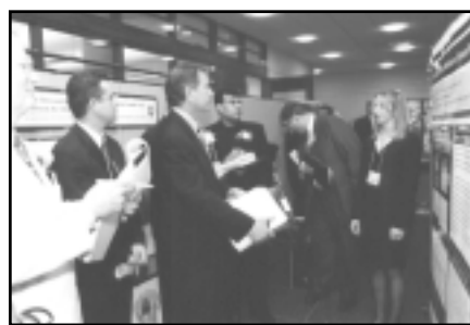
Loyola University Medical Center sponsored a poster competition for medical students.

Programs for the general public, medical students, and healthcare providers were among the events planned by the multi-disciplinary committee at Loyola University Medical Center. A two-day symposium on February 9-10 brought