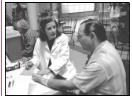
University of California at San Diego Medical Center held screenings at several area malls.