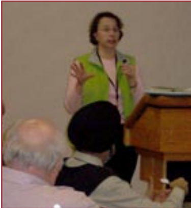
VAMC HF event a success